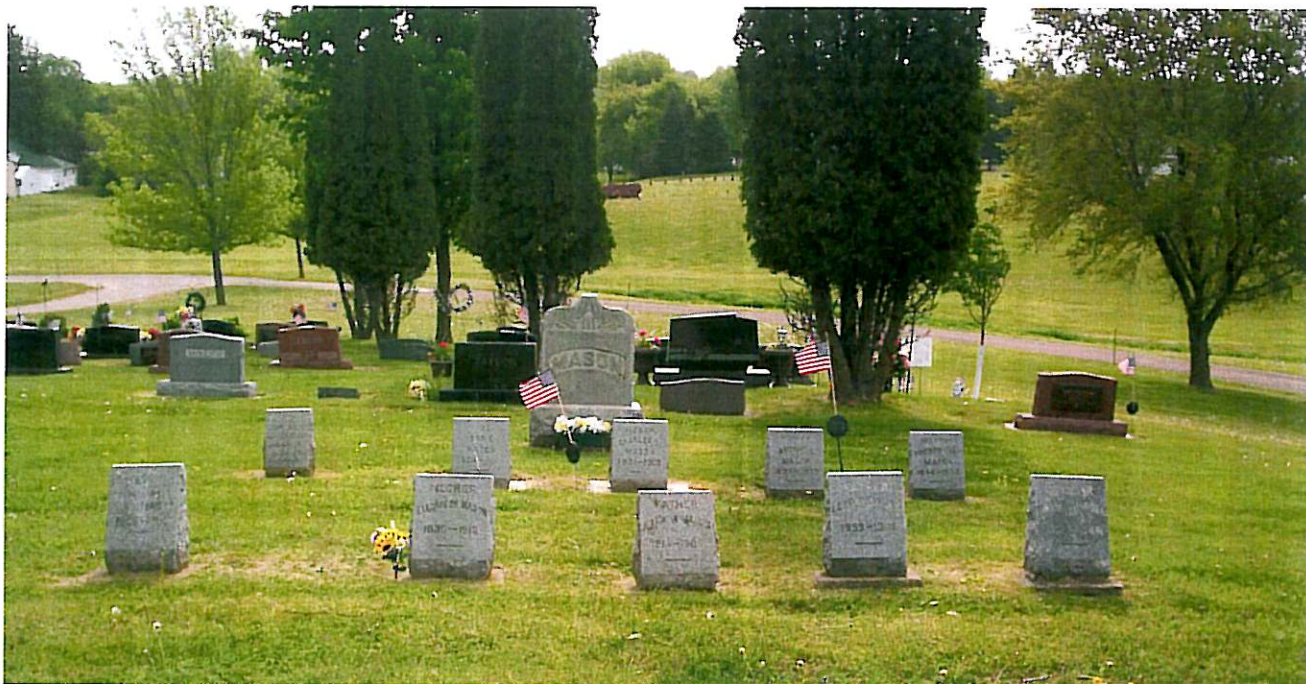
The Mason Family Plot Woodlawn Cemetery, Ripon, Fond du Lac, Wisconsin.